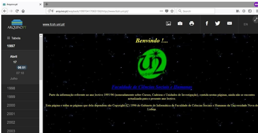
Fig. 1: The first version of the FCSH website preserved by Arquivo.pt ( http://arquivo.pt/wayback/19970417065158/http://www.fcsch.unl.pt/ )

In the early years of the Web, some printed information began being also available on the FCSH website. Over the years, the website scope was extended to also include news, lists of researchers, research programs, access points to various services, becoming a comprehensive portal to academic life at the Faculty.